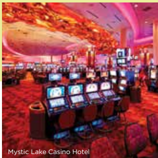
Mystic Lake Casino Hotel