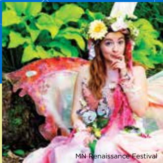
MN Renaissance Festival