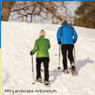
MN Landscape Arboretum