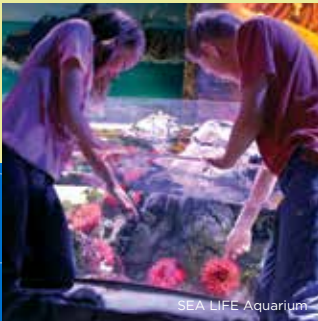
SEA LIFE Aquarium